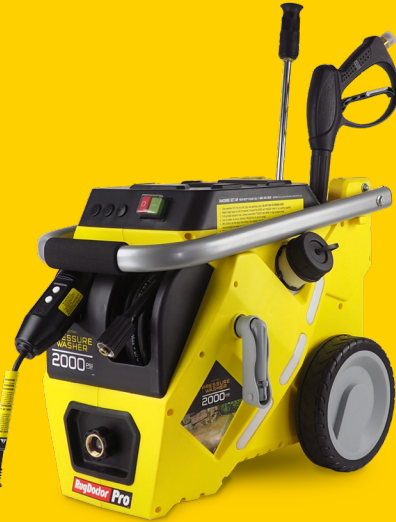
Surface Cleaner rents separately